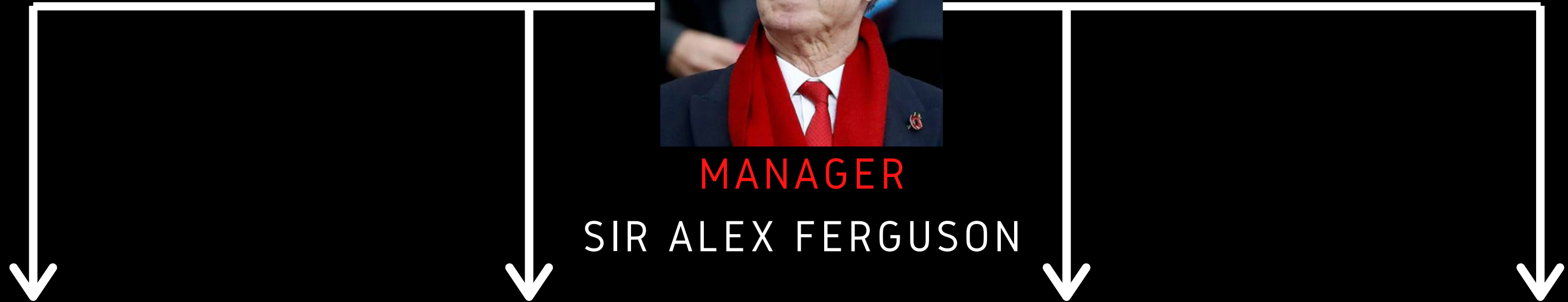
SIR ALEX FERGUSON