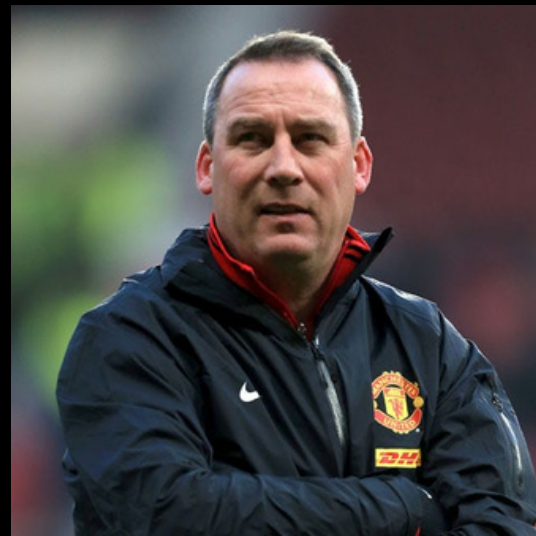
1ST TEAM COACH